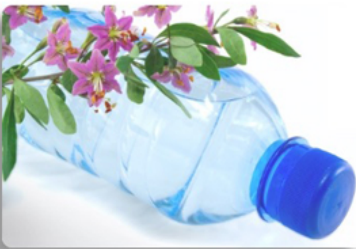
Blue Edge & Green Edge

Color Matching Service helps customers uphold the color of their brand when using PCR.