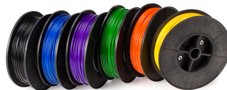
R & D extrusion lines & 3D printing filament extrusion