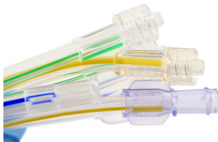
Micro & thin wall tubes

Increasing demand for micro-molded plastics in electronic appliances is expected generate 6% CAGR*